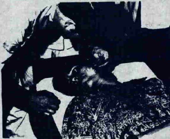
WHEN DISASTER STRIKES--MEMBERS OF THE 154TH USAF DISPENSARY PLAYED A GRISLY ROLE DURING THE JUNE DISASTER PREPAREDNESS EXERCISE, USING REALISTIC MAKE-UP TO SIMULATE INJURIES.

Again, we ask that every member report accidents as soon as they occur...there is apparently not enough importance connected with the timeliness of these reports to Safety.