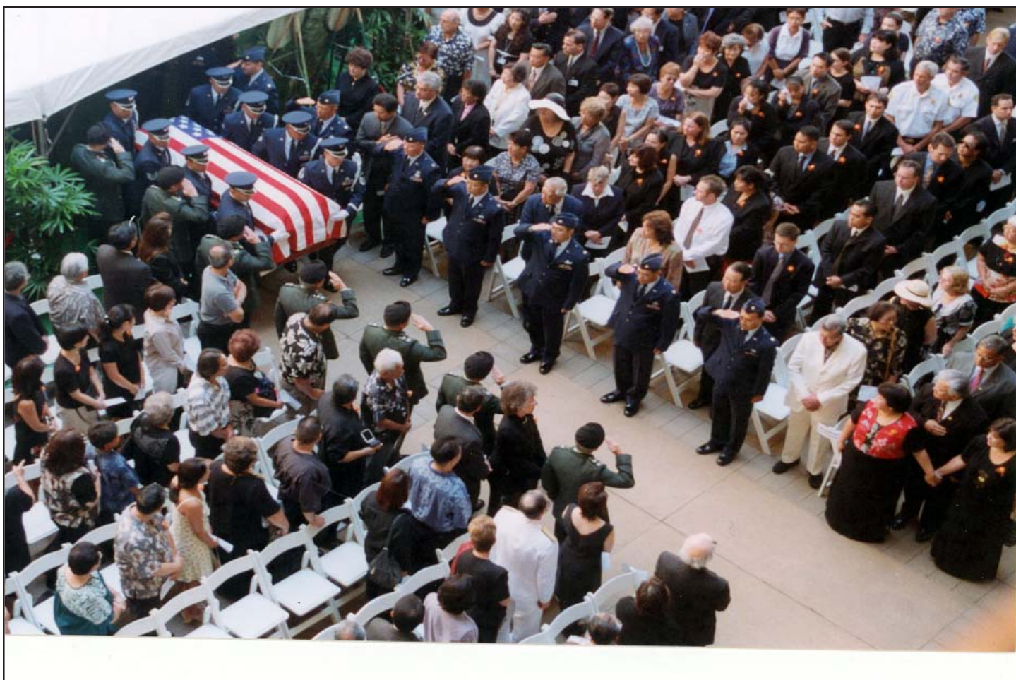
HONORS — Hawaii National Guard airmen and soldiers serve as ceremonial honor guards for U.S. Rep. Patsy T. Mink's memorial service held at the Hawaii State Capitol rotunda in October 2002.