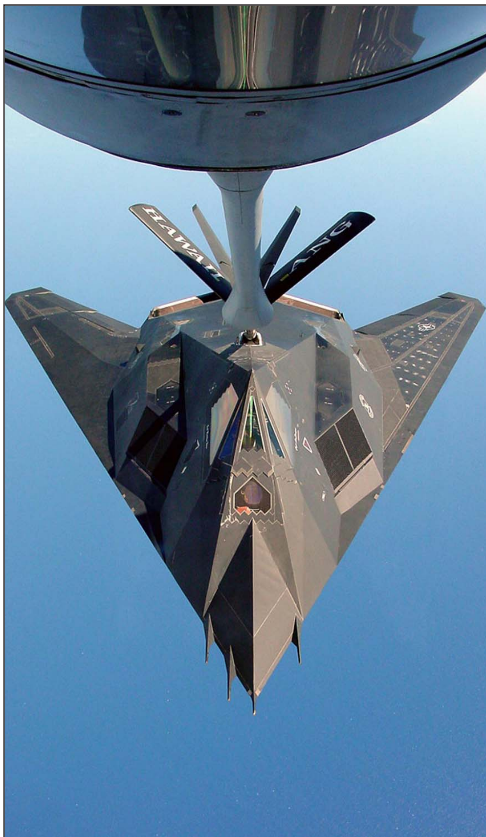
SKY RIGHTER — A U.S. Air Force F-117 Stealth Fighter Bomber is refueled by a KC-135R Stratotanker from the 203rd Air Refueling Squadron in March 2003.

When HIANG airmen weren't forwarded-deployed, participating in operational contingencies, they were on the road participating in multinational exercises. An example was the 204th Airlift Squadron's deployment to India for Exercise COPE INDIA in October 2002. The C-130 aircrews worked with their Indian Air Force counterparts in such activities as paratroop and cargo container airdrops.