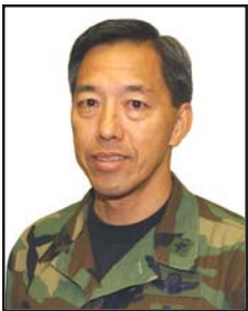
Brig. Gen. Darryll D.M. Wong

The 199th Fighter Squadron is equipped with F-15 A/B Eagle aircraft which serve to provide interceptor capability for the state's air defense system. The 199th is also tasked with augmenting the active duty U.S. Air Force with air superiority fighters