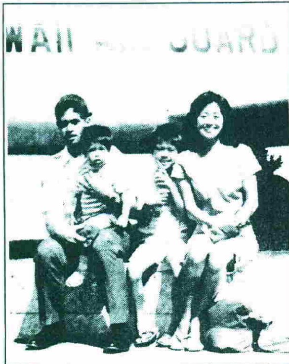
Having a good time at last month's Family Day

On another note: let's continue to pray for our military men and women serving in Operation Desert Shield and their families back home. Much support should be given to the families back home, as well as those in the Persian Gulf region. It's important for everyone's body, mind and spirit to remain healthy. Let's also pray that the Persian Gulf Crisis will resolve itself through peaceful negotiations.