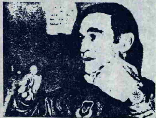
The chief of staff reviews flying maneuvers prior to an operational flight while he was USAF commander in chief.

Even though we've been flying more and doing it more aggressively, our safety record is the best in history. Last year I told you of our unbelievably low record-setting 2.33 rate in '82 - 1983's record was 1.73 accidents per 100,000 hours of flying -- realistic training, not just boring holes in the sky. To date, our 1984 record is about the same as last year's. Many of you have helped us achieve this outstanding record. You are the ones designing and building our airplanes with safety, reliability and maintainability in mind.