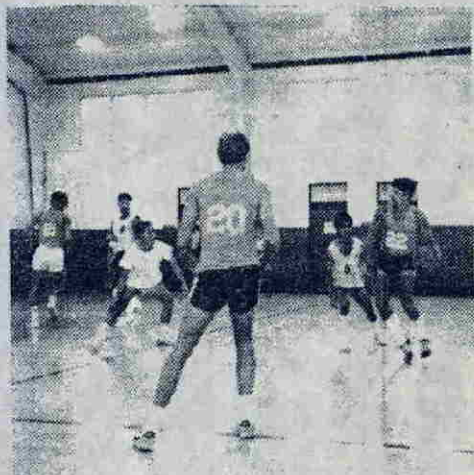
154th COMPG "B" with 169th ACW