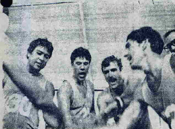
154th COMPG "B" Battle Cry.