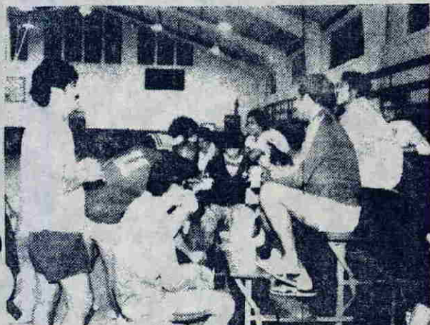
Okay! Halftime over, Lets' play ball!