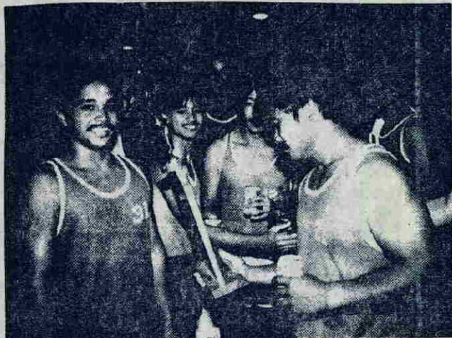
'EH Boys' see what we won!