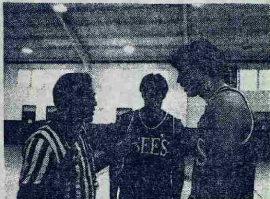
That's it! You're THROUGH!