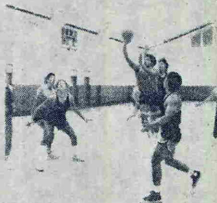
Shoot 'EM Brah!...I get 'EM...