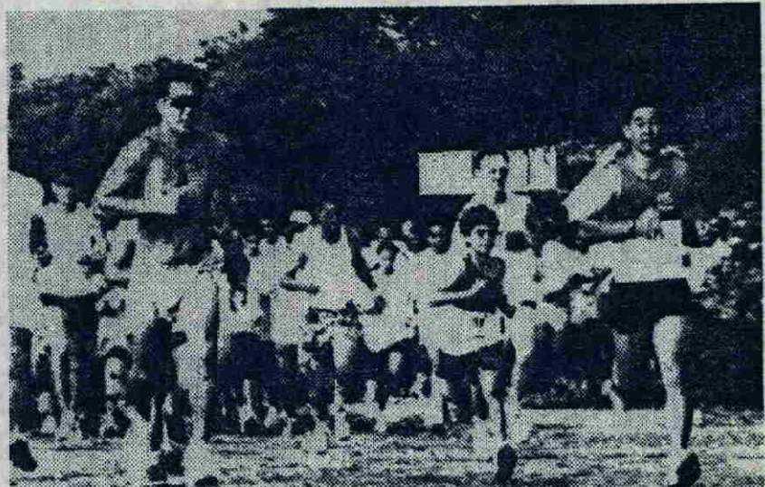
and the race is on!