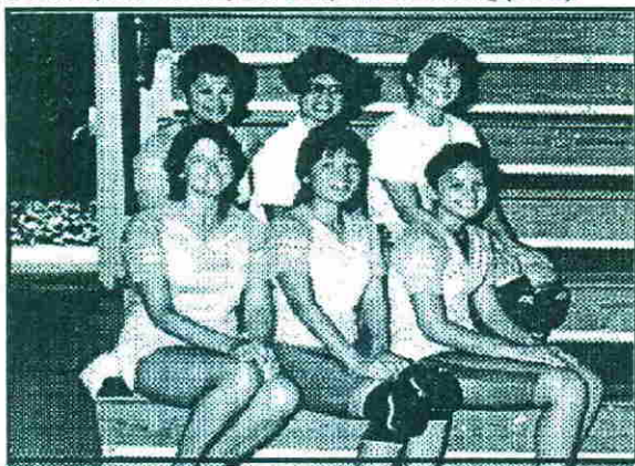
THE WOMEN'S CHAMPS: "B" TEAM

The Women's Division consisted of "A" team (199 TFS, 154 CES, COMPG), "B" team (154 RMS, MSS/MSF, HQ HANG), "C" team, (154 CAMS, 169 ACWS), and "D" team (201 CCGP, 169 ACWS, 199 TFS, 292 CCSQ, Maui). The Co-Ed division consisted of 154's RMS "A", "B", and "C"; CAMS; Combos; and the 201 CCGP. The Open Men's Division consisted of 154's CAMS "A", "B", and "C"; CES; RMS; 201 CCGP; 169 ACWS; 199 TFS; and 292 CCSQ (Maui).