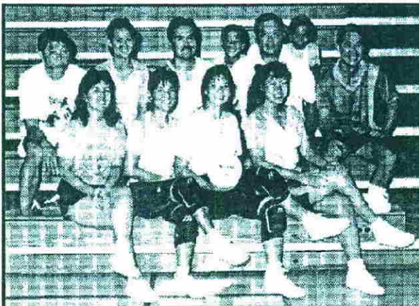
THE CO-ED DIVISION CHAMPS: 154 RMS "A"