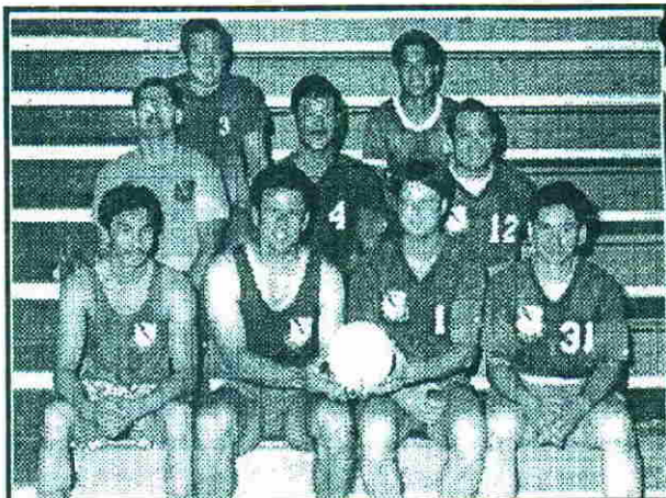
OPEN DIVISION CHAMPS: 201st CCGP