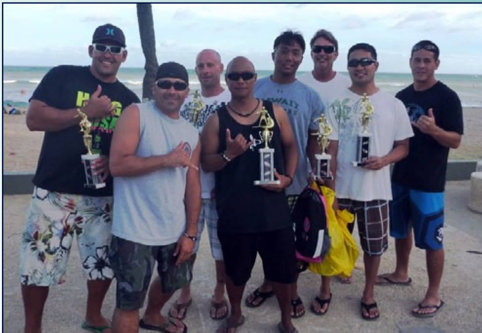
Hawaii Air National Guard surfers show off their winnings after the annual 2011 All-Military Classic in July.