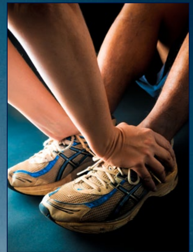
Having a partner hold your feet might be a better way to focus on strengthening your core.