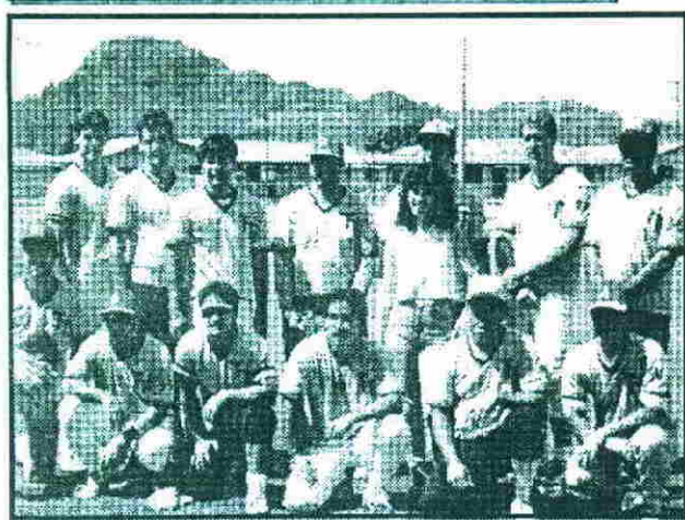
Winners of the 1989 HIANG State Softball Tournament 154 CAM (A).