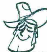
MR. CHUCK ROAST (COWBOY MOVIE STAR)

"I HATE SAVINGS BONDS! WHEN I STEAL THEM I CAN'T EVEN CASH THEM - AND THE OWNER CAN GET THEM REPLACED AT NO COST -"