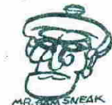
MR. BANKSNEAK (BURGLAR)

"I'M NINETY YEARS OLD AND I DON'T HAVE TIME FOR ANYMORE GET RICH QUICK SCHEMES. BUYING U.S. SAVINGS BONDS IS THE SURE, STEADY WAY TO GET RICH."