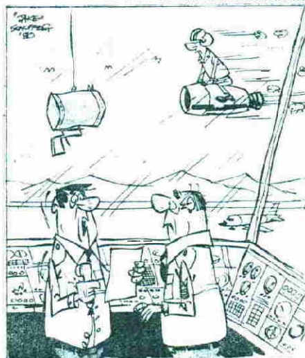
"Some guy called for an emergency landing. Hoga, he's coming in on just one engine."