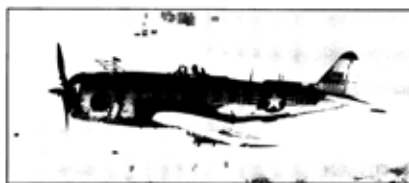
(1947-1954) P-47, later F-47, Thunderbolt