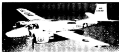
(1952) B-26, also one of the HIANG's first aircraft.