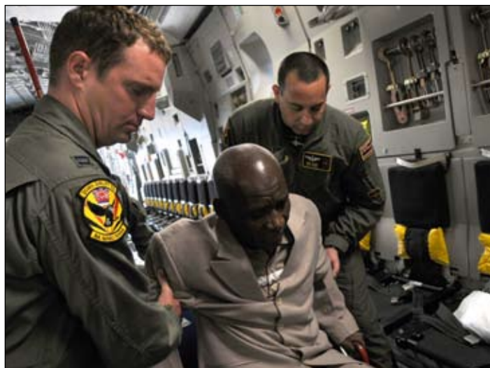
Members of the Hawaii Air National Guard assist a Haitian citizen as he boards the C-17 in Port-au-Prince Haiti.