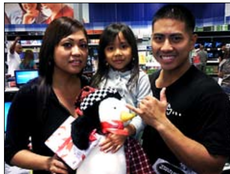
154th Wing 1st Sgts. bring gifts, smiles and joy to children of deployed fathers and mothers during the Christmas season. (courtesy photos)