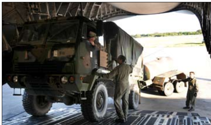
Members of the Hawaii Air National Guard help unload supplies in support of Operation United Command. (Air Force Times photo/photo/Sheila Vemmer).