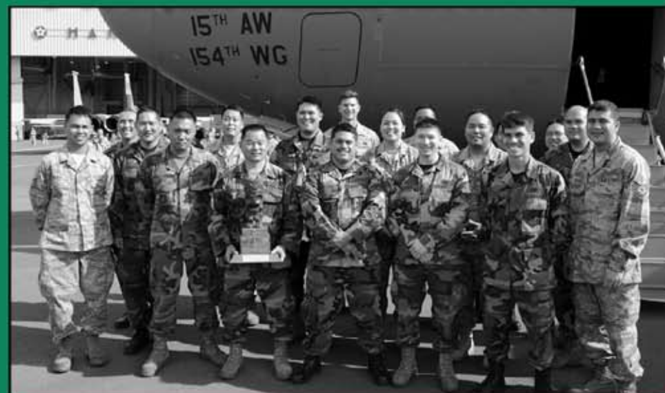
154th Maintenance Squadron Winning Team Of the Year