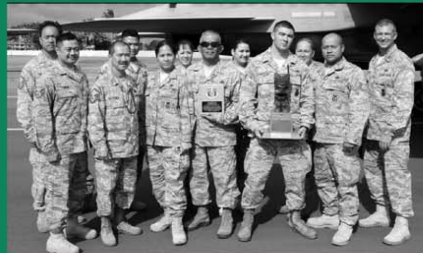
154th Security Forces Squadron Service Team of the Year