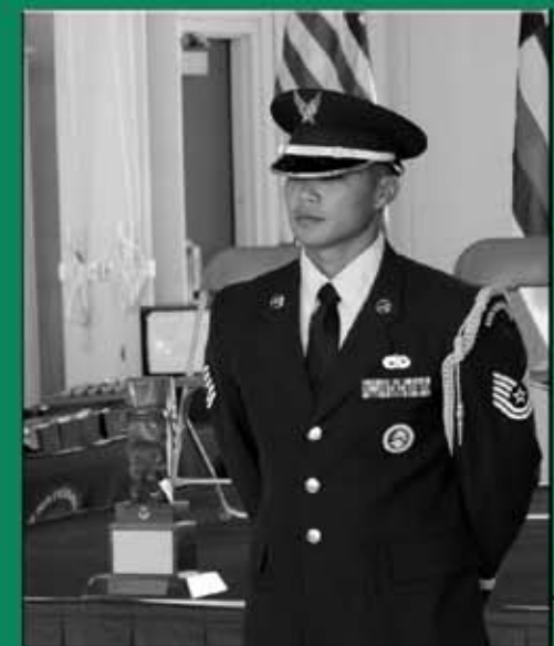
HIANG Honor Guard Member of the Year