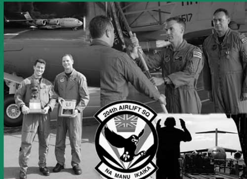
Outstanding Unit of the Year