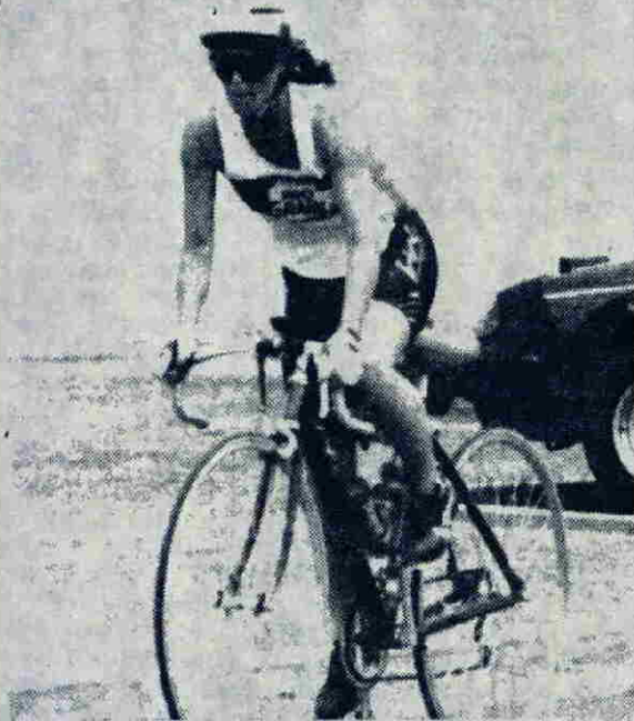
Hickam proved the ideal place for "P.J." to train for running and cycling events.

qualify as participants converge on the Big Island for this supreme physical and mental challenge.